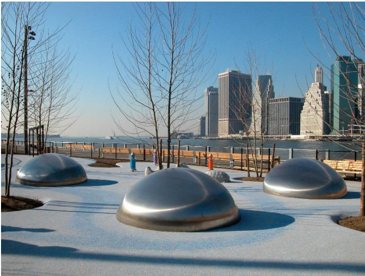
Dome.02 The Dome.02 has a diameter of 2000 mm and is just right for preschoolers.